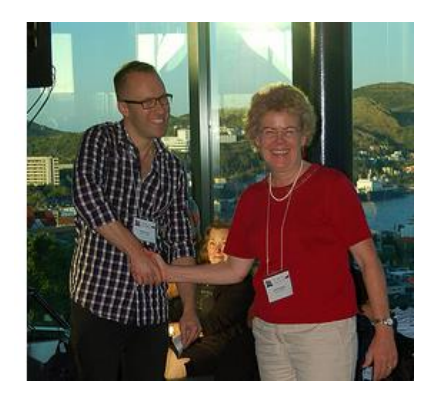
2013 - two recipients