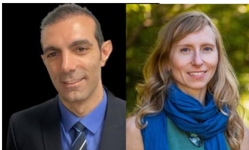
2023 – Two recipients