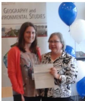
2016 - two recipients