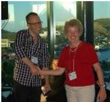
2013 - two recipients