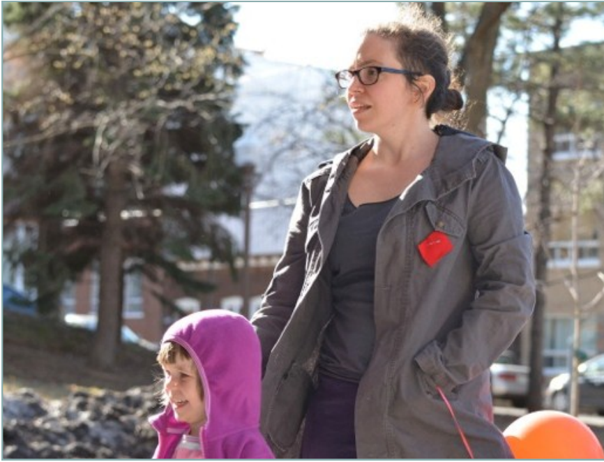
"Me and mini me" (L. Simard)