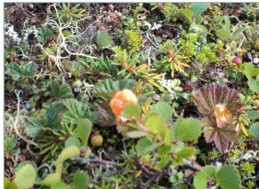
Arpik (cloudberry)

The paper I submitted documents aspects of berry picking and use of Inuit women by following the trajectories of the berries along contemporary networks of sharing. Through this I explore the social nature of berries and highlight meanings of women's practices, both in terms of cultural belonging and (gender) identity. This allows me to challenge binary assumptions that limit the recognition of women's territorial experiences within Inuit studies literature.