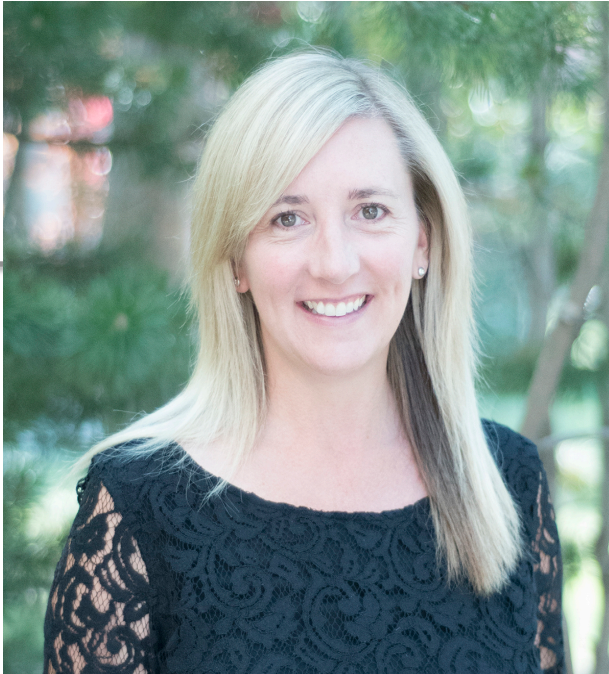
Chief Operating Officer Cybera | Calgary, Alberta